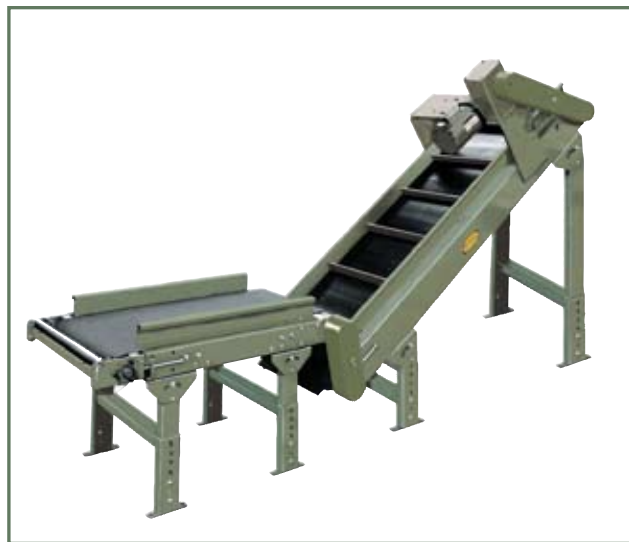
FEEDER SHOWN WITH STANDARD PC TYPE GUARD RAIL, GRAVITY BRACKET WITH POP-OUT ROLLER AND OPTIONAL MS TYPE FLOOR SUPPORTS

CAPACITY —300 lbs. total distributed load at 65 FPM.